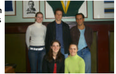
RepriveAustralia's November 2001 interns